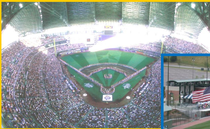
Miller Park - 2002 MLB All-Star Game